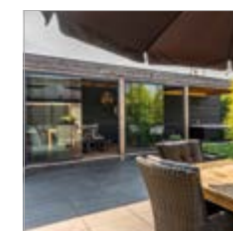
Aura glass sliding doors